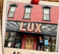
After Party Lux Lounge 3:00 PM