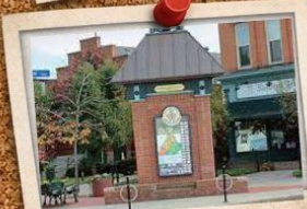
Adventure Begins 1:00 PM